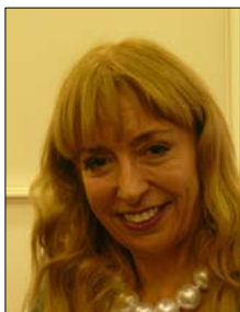
Baroness Susan Greenfield